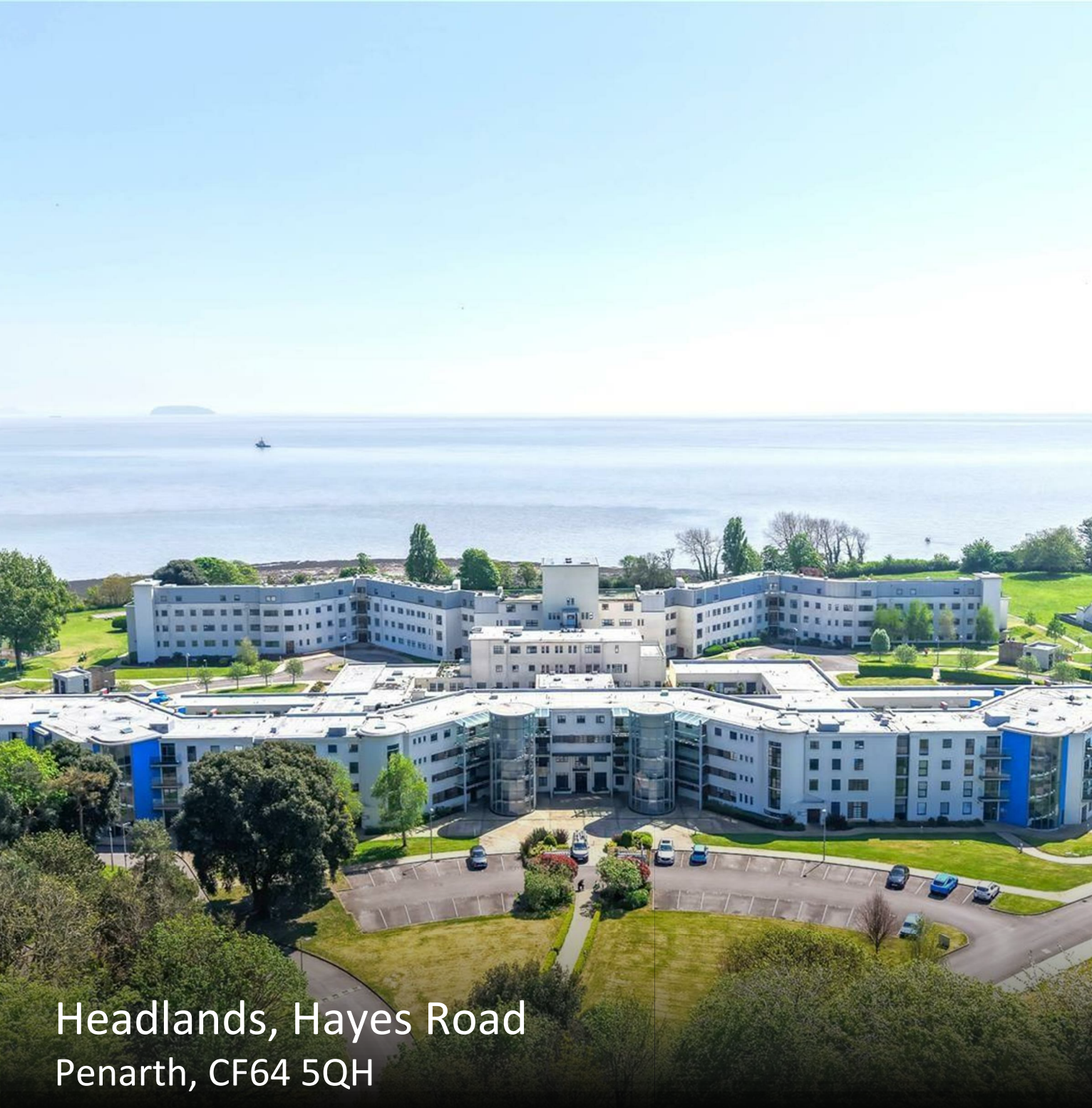
Headlands, Hayes Road Penarth, CF64 5QH